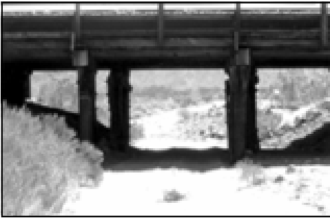
This is the bridge you go under after turning off of frontage road going to new claim.